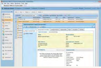
A 360 View of Customers: Manage your customers more effectively by consolidating all customer information and communication into one holistic view.